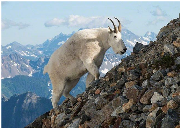
Rocky Mountain Goat