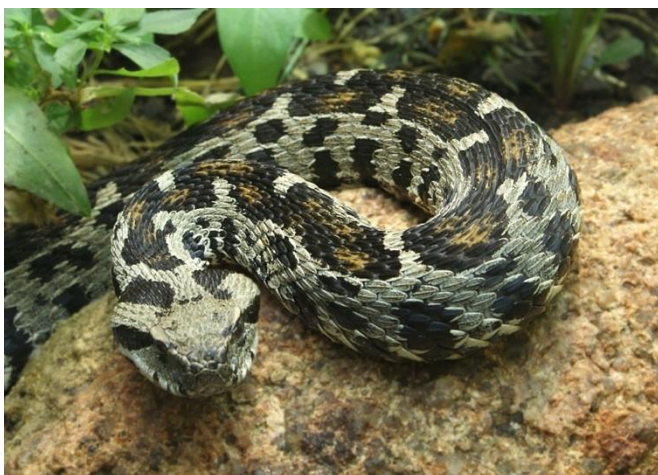
Ocellated Mountain Viper