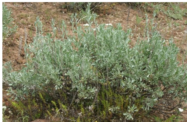
Mountain Big Sagebrush